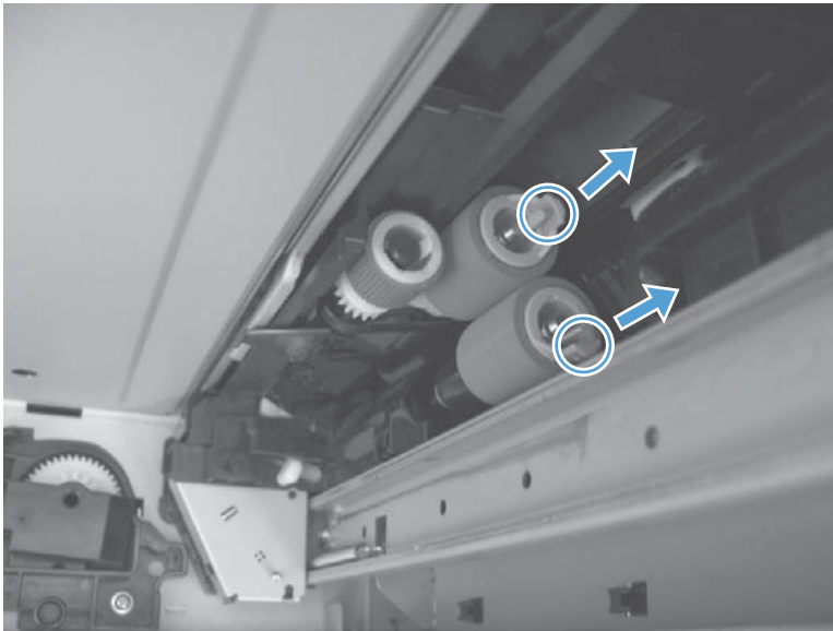
Figure 2-20 Remove the Pickup and feed rollers (Trays 2-5)

💡 Reinstallation tip When you reinstall the rollers, make sure that the rollers snap into place.