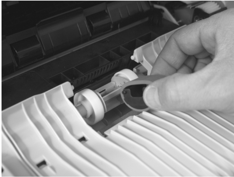
Figure 2-25 Remove the pickup roller (Tray 1) (5 of 5)