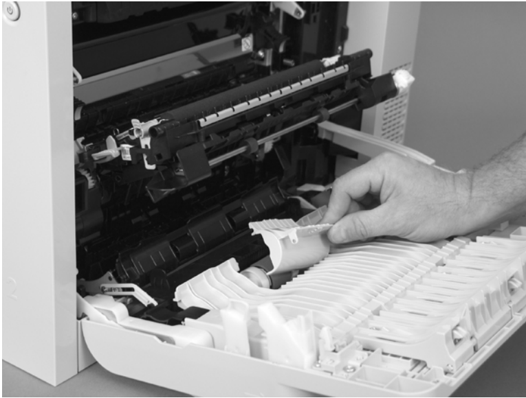
Figure 2-23 Remove the pickup roller (Tray 1) (3 of 5)