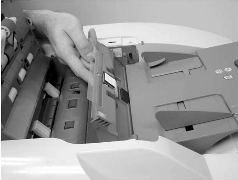
Figure 6-37 Remove the ADF separation pad (3 of 4)