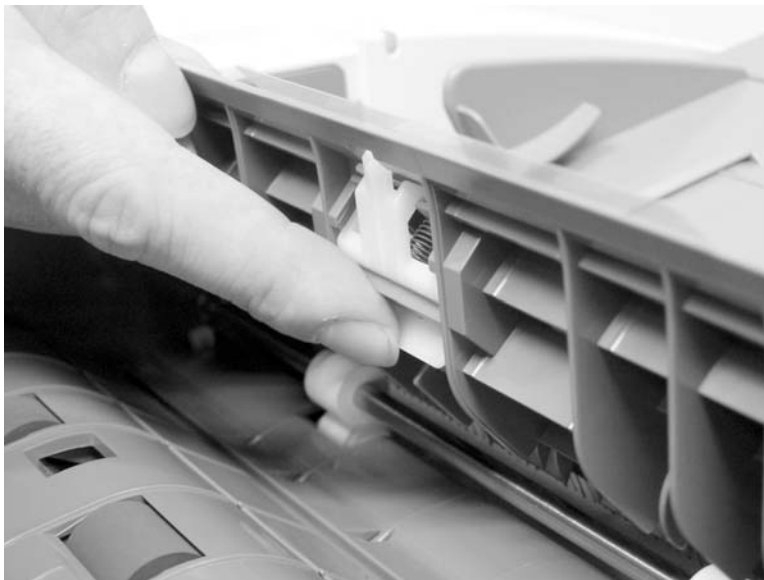
Figure 6-38 Remove the ADF separation pad (4 of 4)