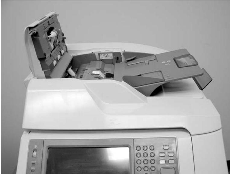
Figure 6-32 Remove the ADF pickup and feed rollers (1 of 3)