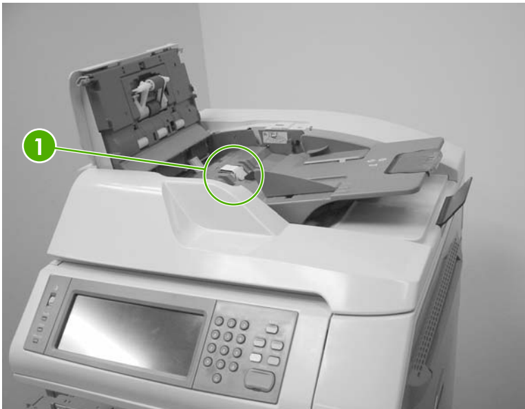
Figure 6-36 Remove the ADF separation pad (2 of 4)