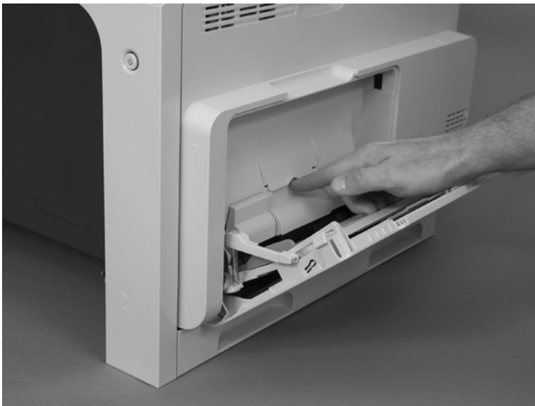
Figure 1-67 Remove the pickup roller (Tray 1; 2 of 5)